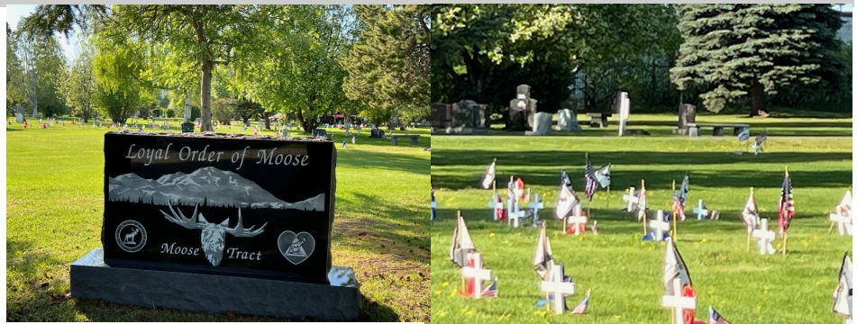
Downtown Cemetery Moose Tract

Thank you for everyone who showed up to decorate the Moose Tract for Memorial Day.