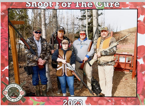
The Moose Lodge Team at this years Shoot for the Cure.